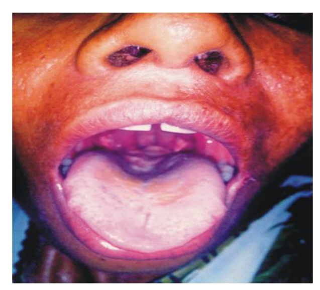
Fig. 1 Photograph of oral cavity showing a semispherical tumor-like lesion.